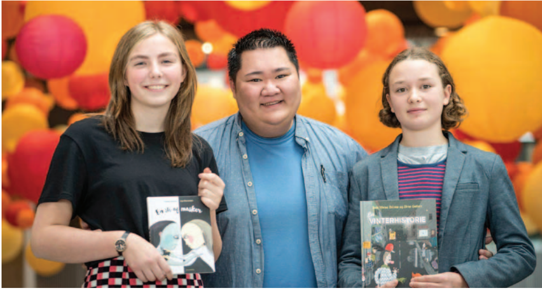
500 Words winners