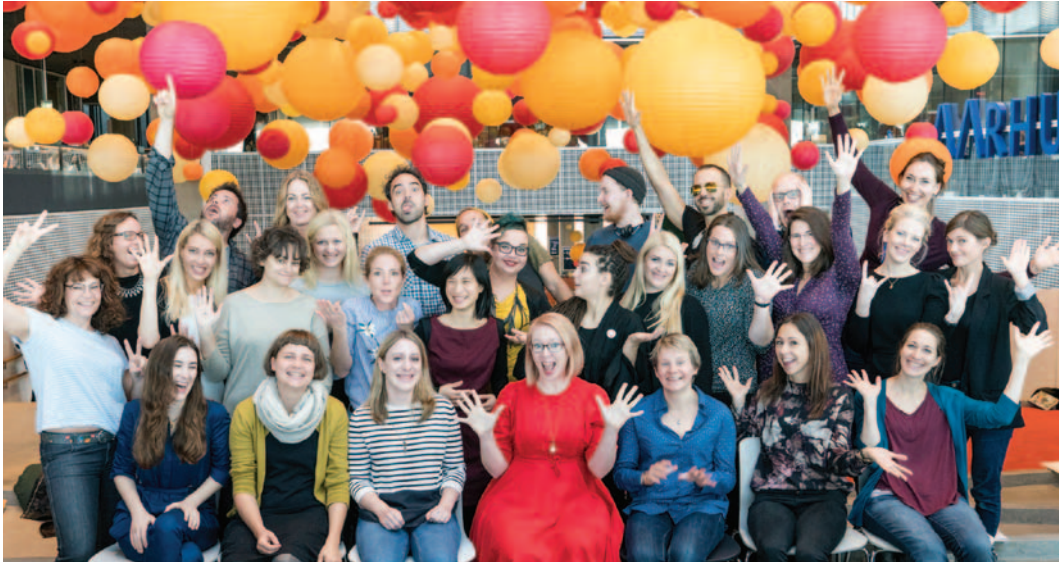
The Aarhus 39 writers

Click this link to see Hay Festival Aarhus video